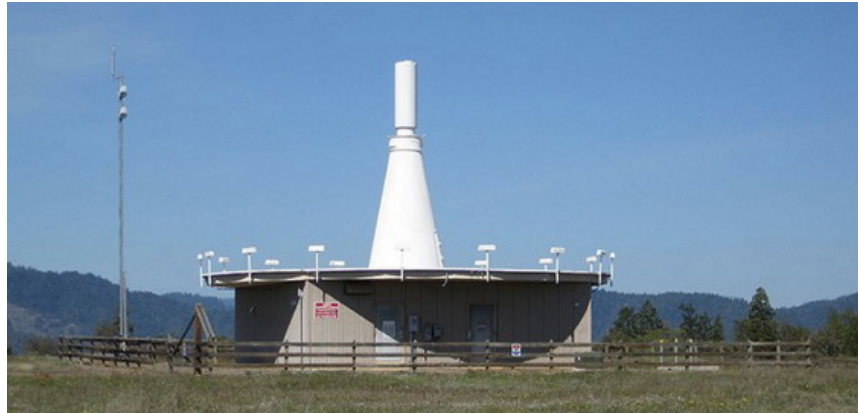
VHF omnidirectional radio range (VOR)

Aircraft position and intent information directed to automated, ground-based ATMS will enable strategic and tactical flight deck-based separation assurance in selected situations, such as conflict