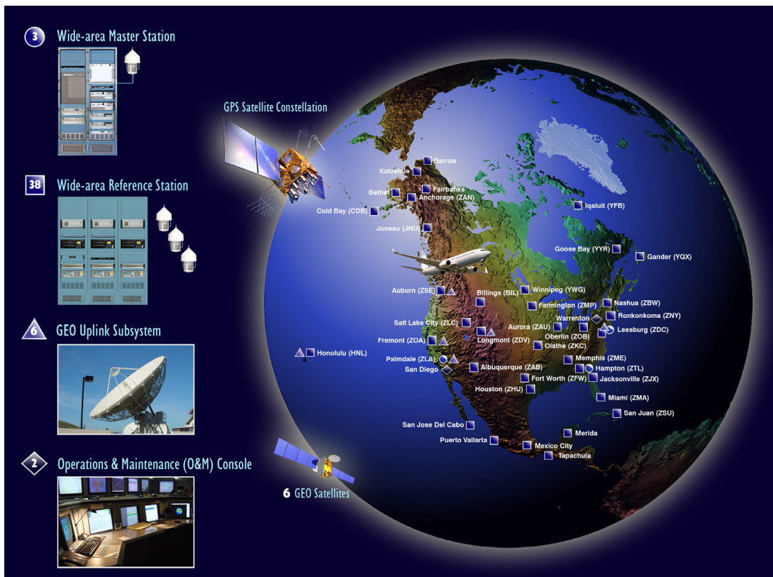
WAAS Architecture – Global View

By 2030, dual frequency (DF) SBASs should be achieving initial operational capability in North