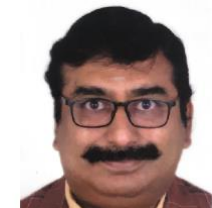
Satya Subramaniam Bangalore International Airport