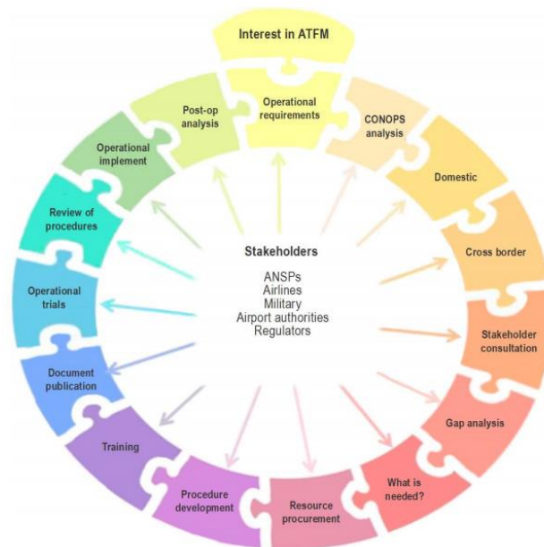
Figure II-8-1. ATFM implementation steps