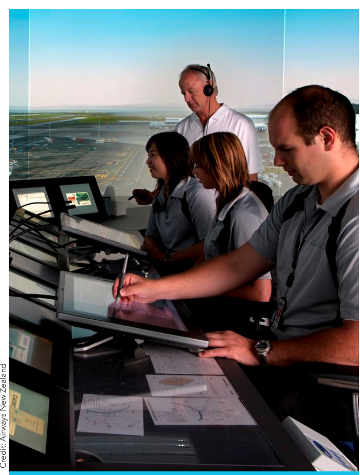
Airways New Zealand's Total Control simulator suite.

Vietnamese air traffic control students are accessing world-class advanced training in a safe, supportive environment as part of a strategic partnership between Airways New Zealand and Vietnam Air Traffic Management Corporation (VATM).