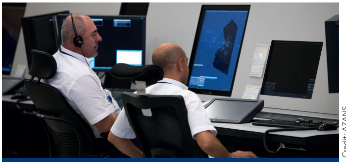
Azerbaijan has implemented its first virtual air traffic control tower.

But most of all, it needs partnership between ANSPs and the aviation value chain. Let's put our efforts into breaking the isolation of the ANSP world. \checkmark