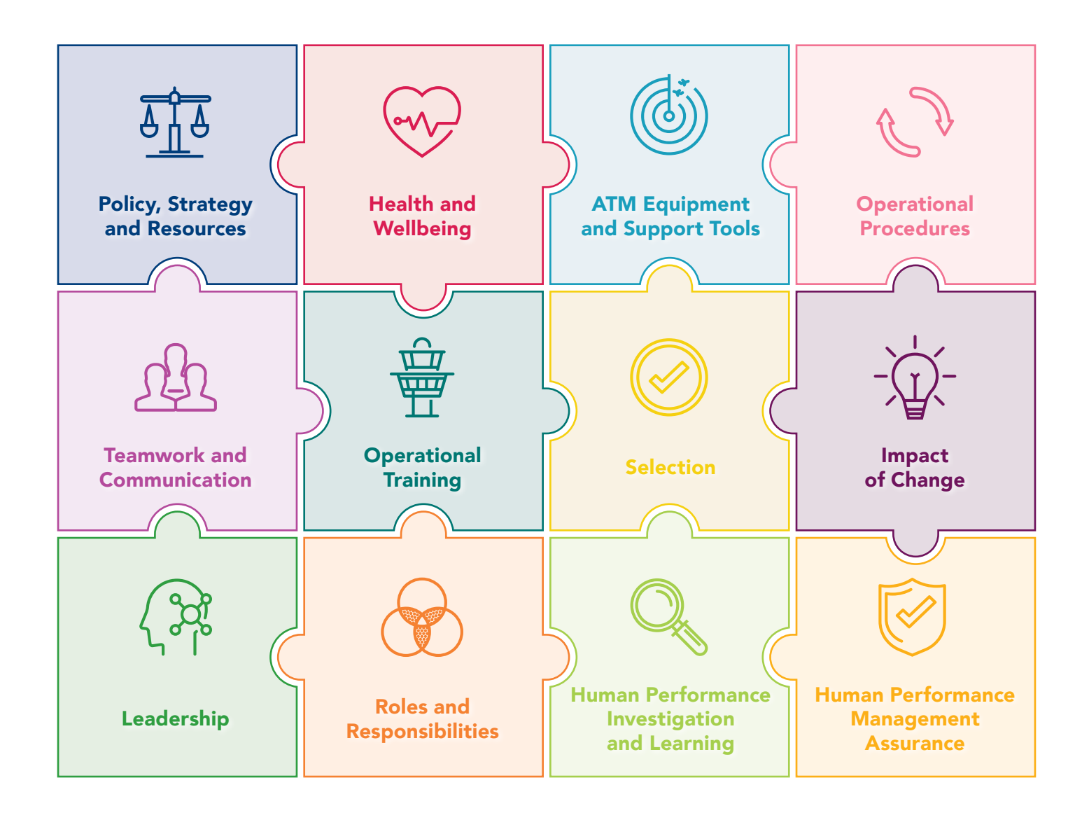
Figure 1: The 12 elements of the CANSO Standard of Excellence in Human Performance Management.

a result of reviewing best practice within ATM and across other safety-related industries, 12 elements of human performance have been identified and addressed by the CANSO Standard of Excellence in Human Performance Management.