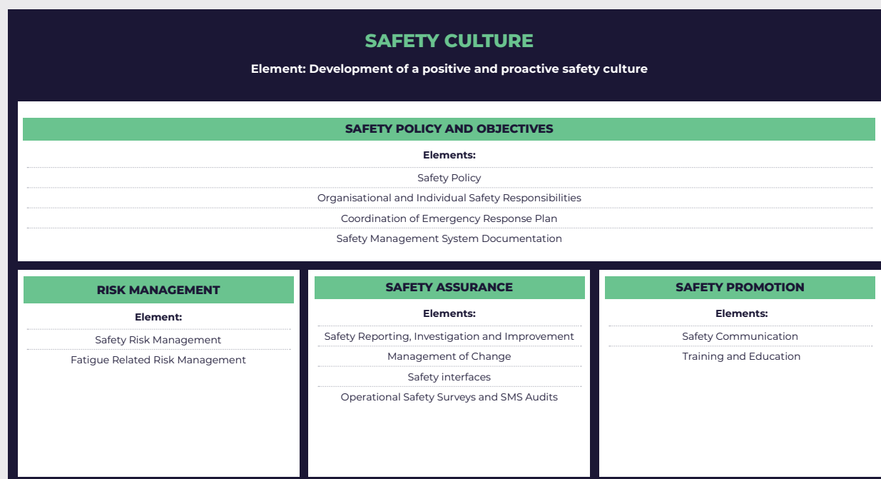
Figure 1. SoE in SMS Framework

The SoE in SMS is built on an SMS model that consists of a system enabler (Safety Culture) and a framework of four components addressing 12 further elements. The structure of that model is presented below: