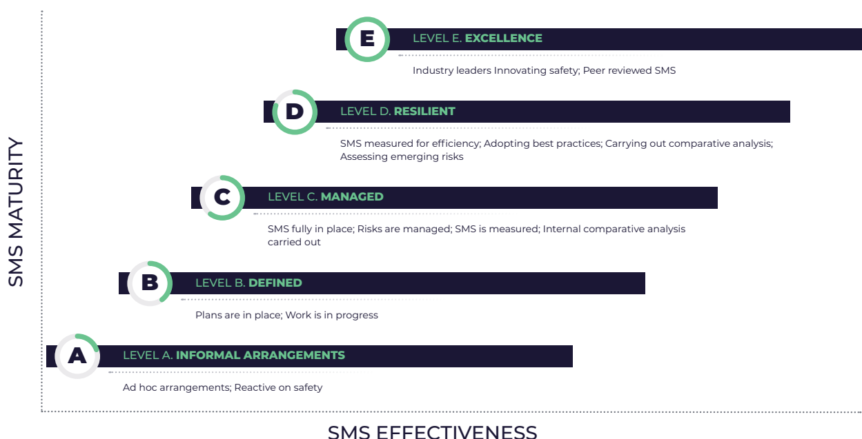
Figure 3. SMS Maturity Pathway

Note that it is both difficult and expensive for an ANSP to increase its maturity level and that not every ANSP would be expected to reach Levels D or E. Furthermore, robust evidence is required to justify claims for maturity Levels D and E.